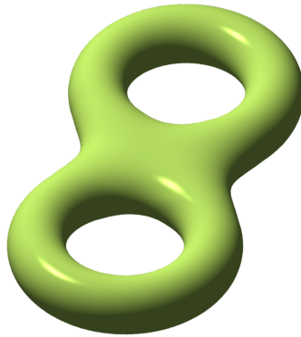
Figure 2: The double torus[2]

Imagine taking two copies of the torus, cutting a small circular hole out of each one, and then gluing the surfaces together at the boundaries of the circular holes, to get a double torus: